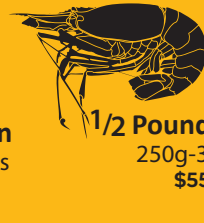
1/2 Pound Prawn 250g-300g $55