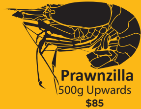
Prawnzilla 500g Upwards $85

The Freshwater Prawns of Sri Lanka, also known as Lake Lobsters or Mekong Lobsters, are giants compared to their counterparts in Southeast Asia and it is very rare to find a consistent supply of prawns of this size. In fact, Sri Lanka has the distinction of being one of a very few countries blessed with this culinary gem. They are farm hatched and wild-caught, growing to great sizes in the amazing lakes across the island.