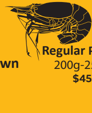
Regular Prawn 200g-250g $45