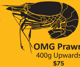
OMG Prawn 400g Upwards $75