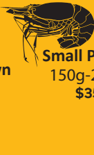
Small Prawn 150g-200g $35